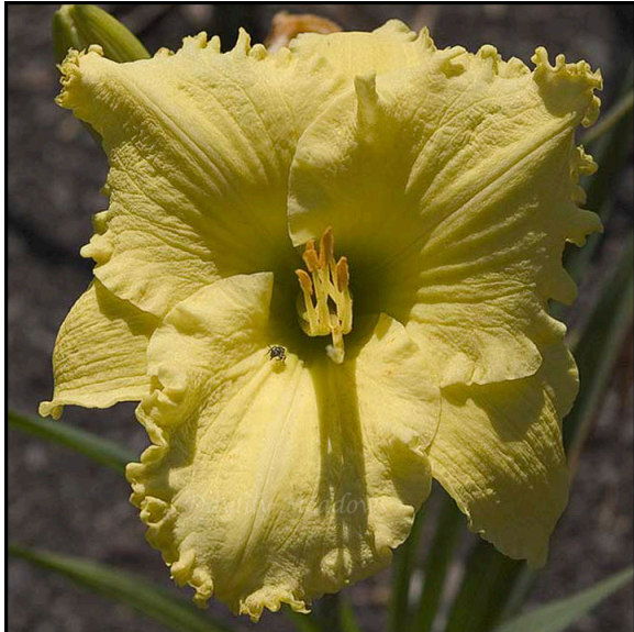
Banana Pudding Delight